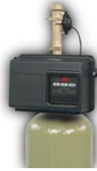
1 " Valve with meter option