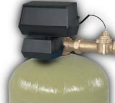
2" Valve with meter option