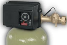
1 1/2" Valve with meter option