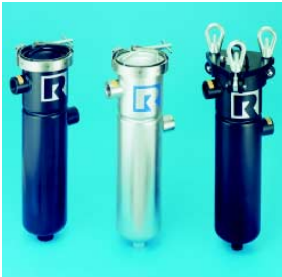
Clamp covers to the left and center, and eyenut cover to the right.